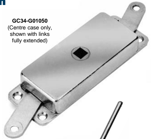
GC34-G01050 (Centre case only, shown with links fully extended)