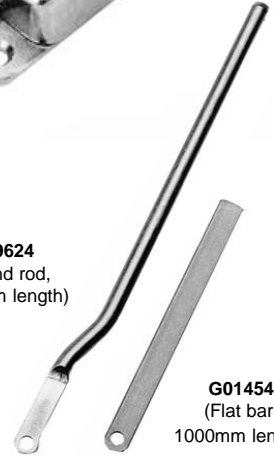
G01454 (Flat bar, 1000mm length)